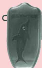
Optional protecting box